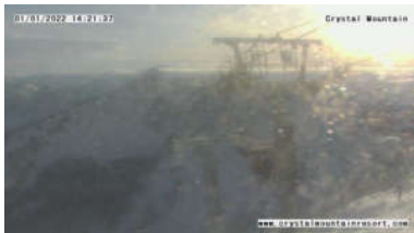
CHAIR 6 (7,002 FT.)